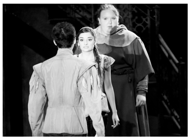
SUMMER SHAKESPEARE INTENSIVE 2008, STUDENT ACTORS PERFORM SCENE FROM ROMEO Y JULIETA .

For the young person who wants to work in theatre but isn't interested in acting, there are literally hundreds of opportunities for careers in theatre and film. The vast majority of these jobs are behind